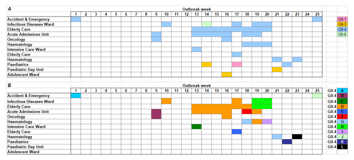
Figure 1. Timeline of 25-week outbreak period by ward and norovirus strain type. (A) All strains. Colours represent norovirus strain types determined by standard strain typing. (B) GII.4 strain only. Colours represent norovirus sub-strain types determined by analysis of the hypervariable P2 domain.

hospital in this study period (4 strains, one of which included 12 sub-strains). The most commonly detected sub-strain (GII.4D) affected 30 patients (65.2% of the 46 GII.4 strains).