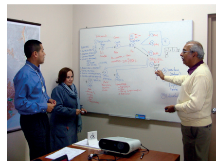
International Eye Foundation

The leaders must develop confidence in the change process. Help them to