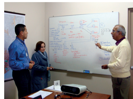
International Eye Foundation