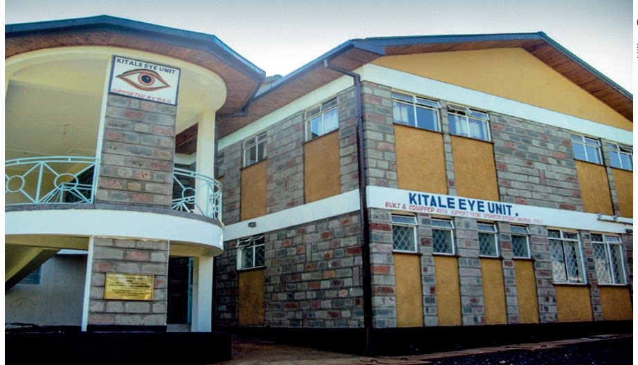
Kitale eye unit was built and equipped with support from Operation Eyesight Universal.