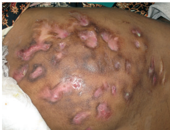
Figure 1 Cutaneous melioid affecting the buttock.

A diagnosis of melioidosis was made, and the patient was treated with intravenous ceftazidime (2 g