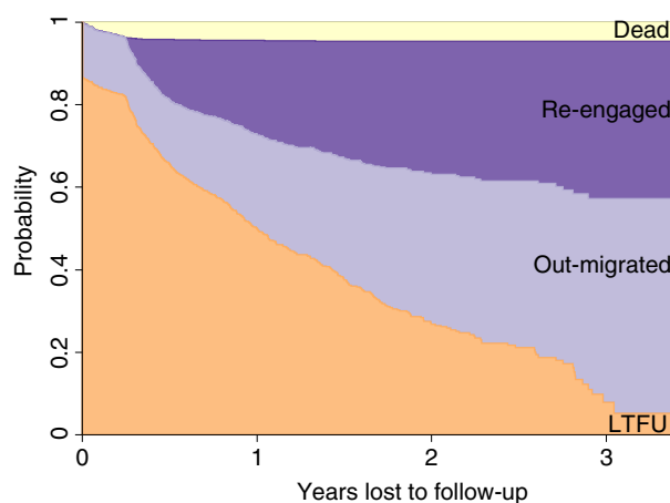
Figure 3 Patient outcomes after LTFU ascertained through record linkage between clinic records and AHDSS, Agincourt (2014–2017).

Of the patients who resumed HIV care, 43.8% re-engaged in the same health facility, 53.9% continued treatment at another health facility and 2.2% continued care at two facilities in the AHDSS area. The cumulative incidence of transferring to another facility in the study site was 3.2% (95% CI 2.2–4.4%) at 1 year and 14.4% (95% CI 10.8–18.6%) at year 3.