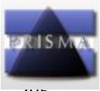
Figure 1. PRISMA Flow diagram of study selection