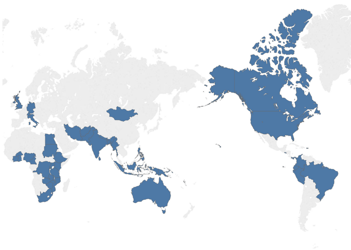
Fig. 3 Countries represented at the first, second and third GICS meetings

Vellore, India, in January 2018 where 110 participants (two-thirds from LMICs) representing 33 countries were in attendance. The effort to promote LMIC leadership is replicated at every level of the GICS organization with 50% of the Board of Directors being from LMICs and all working groups being led by providers from LMICs.