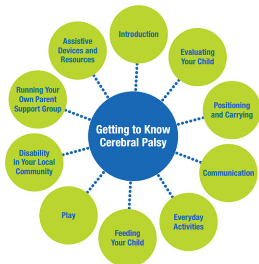
FIGURE 1 Outline of modules for parent support group training, available at http://disabilitycentre.lshtm.ac.uk/getting-to-know-cerebral-palsy/ [Colour figure can be viewed at wileyonlinelibrary.com ]

screening was used to find sufficient local cases to run the group. Children had a confirmed diagnosis of cerebral palsy and were aged 18 months to 12 years, and caregivers had not attended any parent support group nor any regular physiotherapy with their child.