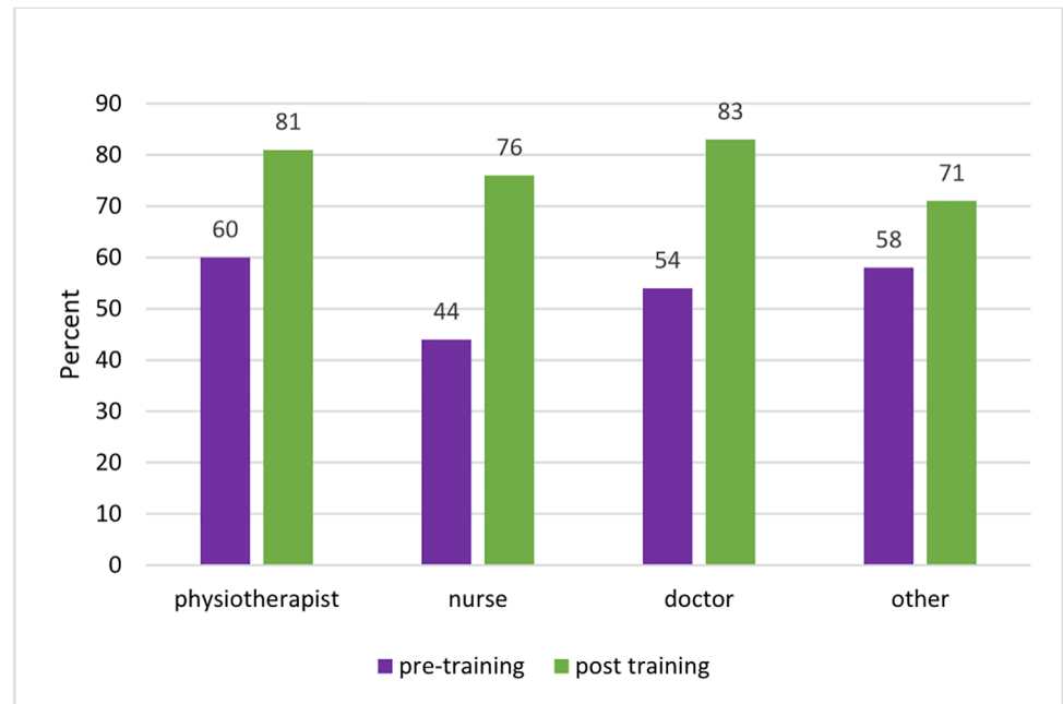
Fig 2. Pre- and post-course knowledge performance by cadre.

https://doi.org/10.1371/journal.pone.0203564.g002