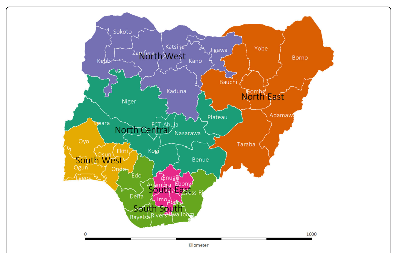
Fig. 1 Map of Nigeria showing boundaries of six geopolitical zones, 36 states and Federal Capital Territory (FCT-Abuja). Shapefile is obtained from gadm.org. The 2018 GADM license allows data re-use for academic and other non-commercial purposes (https://gadm.org/license.html, last accessed: 14th May 2018)

The outcome of interest was financial barrier for FBD. Women who did not deliver in a HF indicated the reasons that applied to them from a list of potential barriers, including "cost too much". Other covariates and demographic information considered as potential confounders were: wealth quintile, maternal education, maternal age and parity at the time of the most recent birth, and whether the woman had health insurance coverage. Household wealth quintile was derived from the wealth index – constructed by the DHS using household asset data via a principal component analysis [19]. The sampled households were than ranked and divided into five quintiles. Each woman is assigned her household's wealth quintile.