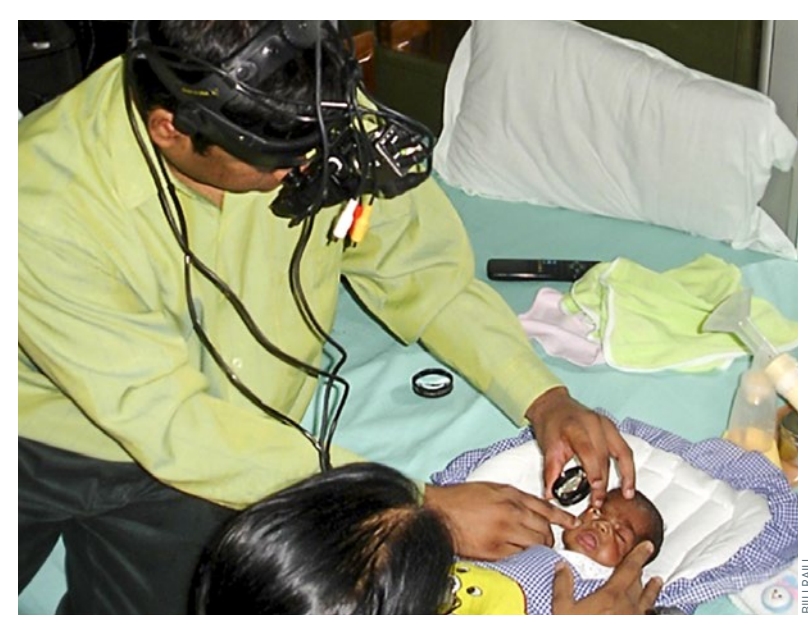
Ophthalmologist checks whether ROP treatment has been successful. INDIA

Laser treatment of ROP is highly effective. However, special care should be taken when treating preterm or newborn infants, and long-term follow-up is essential. There are also new treatments on the horizon, particularly in cases where laser treatment is not possible or has failed.