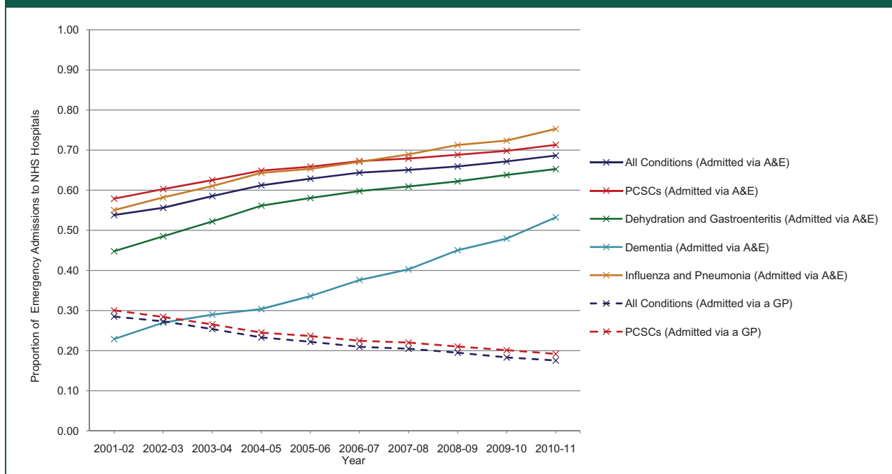
Figure 1. Proportion of Emergency Admissions in which Patients were Admitted via A&E, or via a GP, in England, 2001–02 to 2010–11.

Data are from Hospital Episode Statistics (HES), a national administrative database containing details of all admissions to NHS hospitals in England. The primary care sensitive conditions (PCSCs) analysed were: angina; asthma; cellulitis; congestive heart failure; convulsions and epilepsy; chronic obstructive pulmonary disease; dehydration and gastroenteritis; dental conditions; diabetes complications; ear, nose and throat infections; gangrene; hypertension; influenza and pneumonia; iron-deficiency anaemia; nutritional deficiency; other vaccine-preventable diseases; pelvic inflammatory disease; perforated/bleeding ulcer; and pyelonephritis, as defined by Purdy, 15 in addition to dementia and atrial fibrillation as defined in the NHS Outcomes Framework. 12