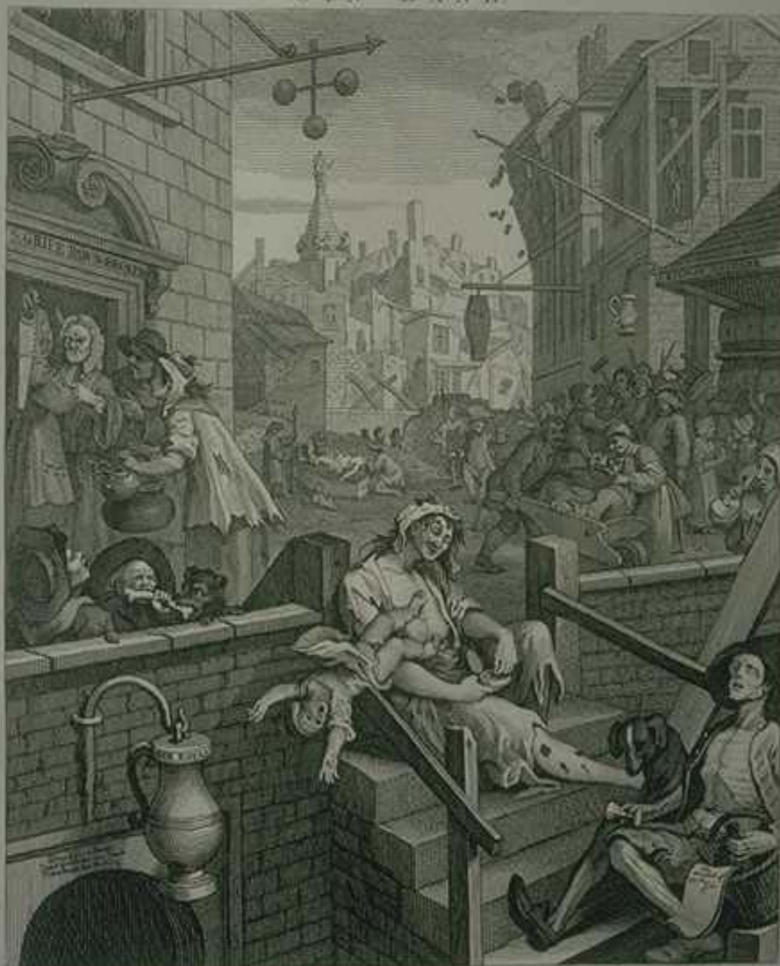
The good Friend with my Daughter, This Friend with my Son, A man of a good Trade, A woman of a good Trade, A man of a good Trade,