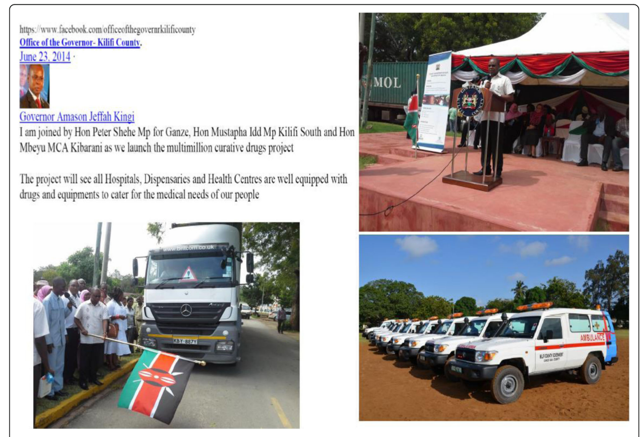
Fig. 3 Images of the Kilifi County Governor flagging off drug distribution; and the Kilifi County ambulances

Omar [4] argued that the political drivers and context that push a country to adopting decentralized governance arrangements have a major bearing on how decentralization gets implemented in that setting [4]. From our findings, the political context in Kenya caused the transfer of devolved health sector functions to be done faster than had been anticipated by most health sector players (Tsofa B, et al.: How does decentralisation affect health sector planning and financial management? A case study of early effects of devolution in Kilifi County, Kenya, submited) [25]. This happened at a time when the county governments had not set up their organizational structures and built capacity for these structures to undertake their functions, causing