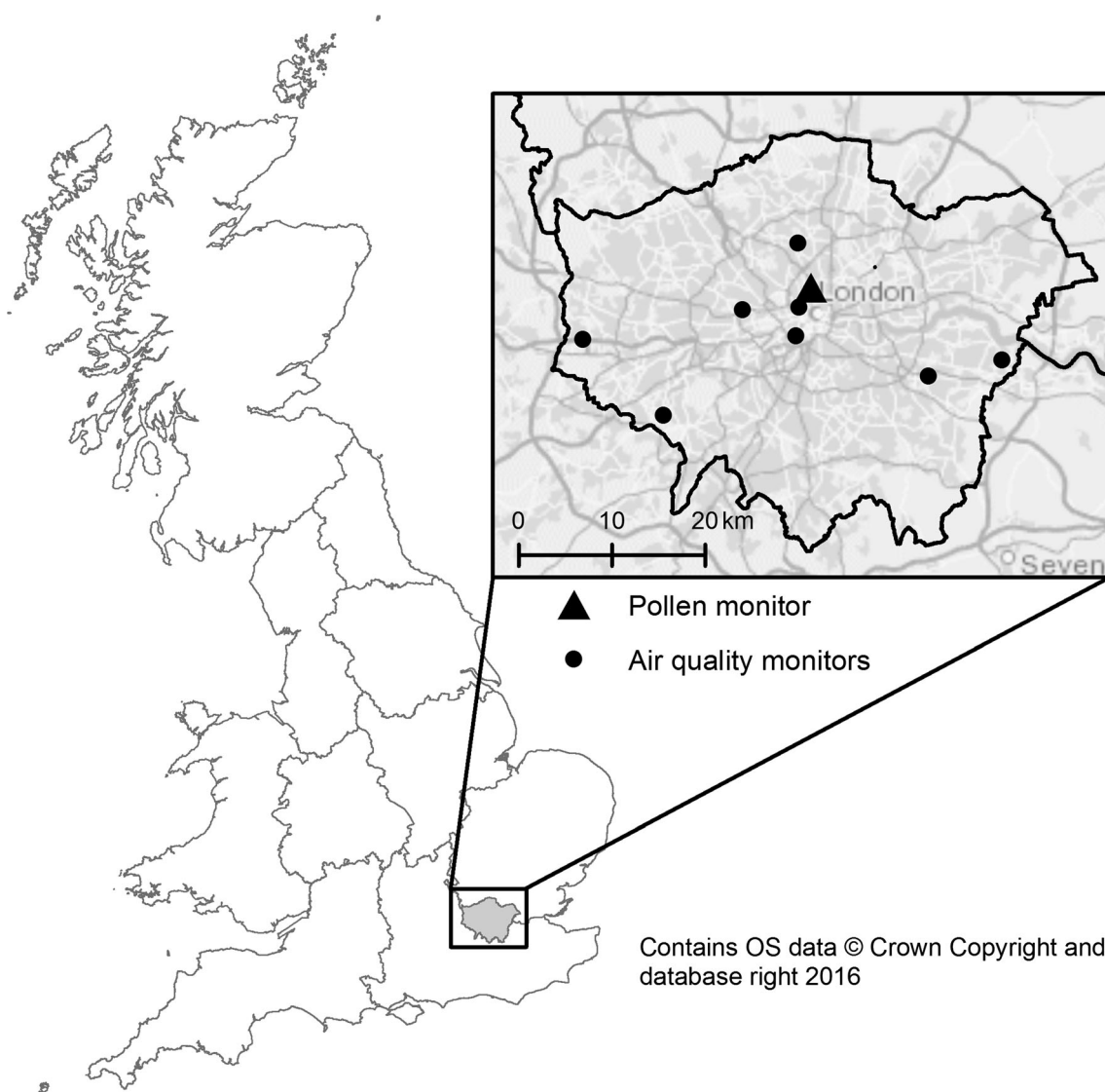
Fig. 1 Locations of pollen and air quality monitors, within London Government Office Region

data on the asthma outcome, day of year, year, humidity, precipitation, and temperature were included. The mean of 20 imputations for each station was used to fill missing station data. Following imputation, the daily mean concentration for each pollutant across London was calculated as the mean across all included stations.