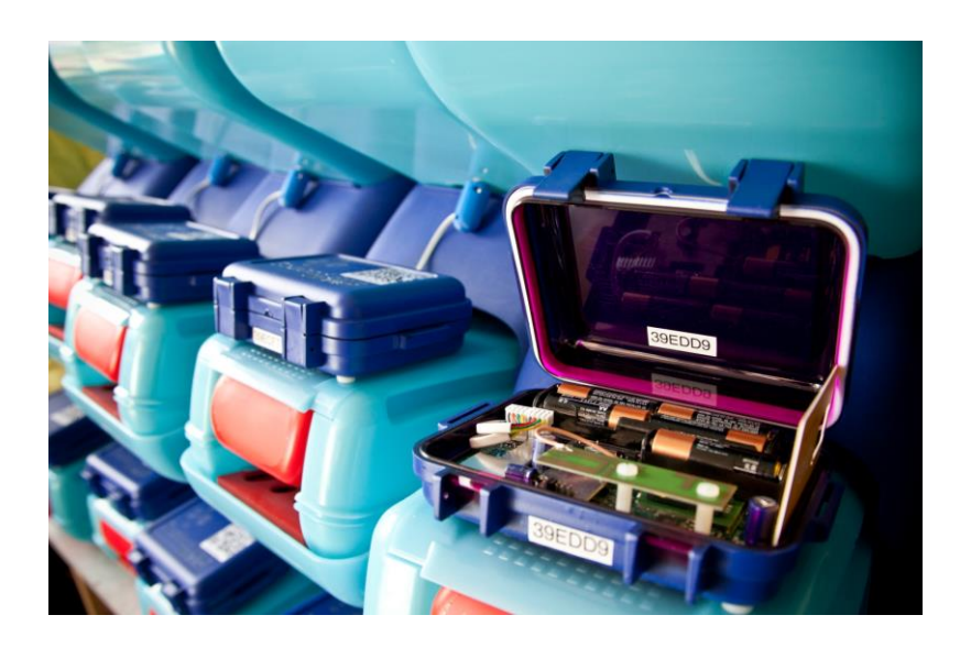
Figure 1 Sweetsense sensor affixed to Lifestraw filter.