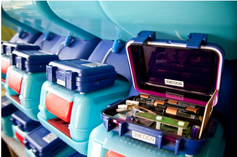
Figure 1 Sweetsense sensor affixed to Lifeflow filter.