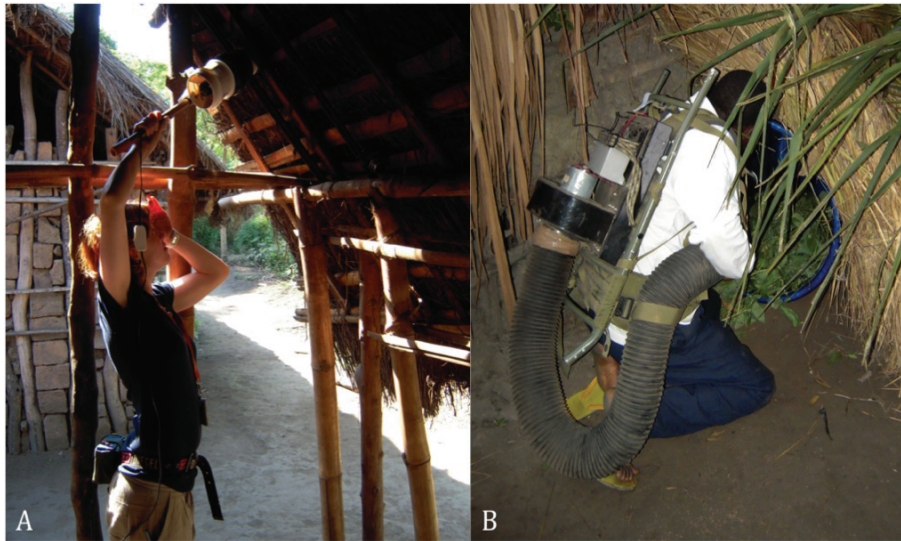
Figure 1 Prokopack and CDC backpack aspirator. A - Collector using the Prokopack aspirator to sample mosquitoes from underneath the roof of a kibanda . B - Collector using the CDC backpack aspirator to sample mosquitoes from inside a barrel.