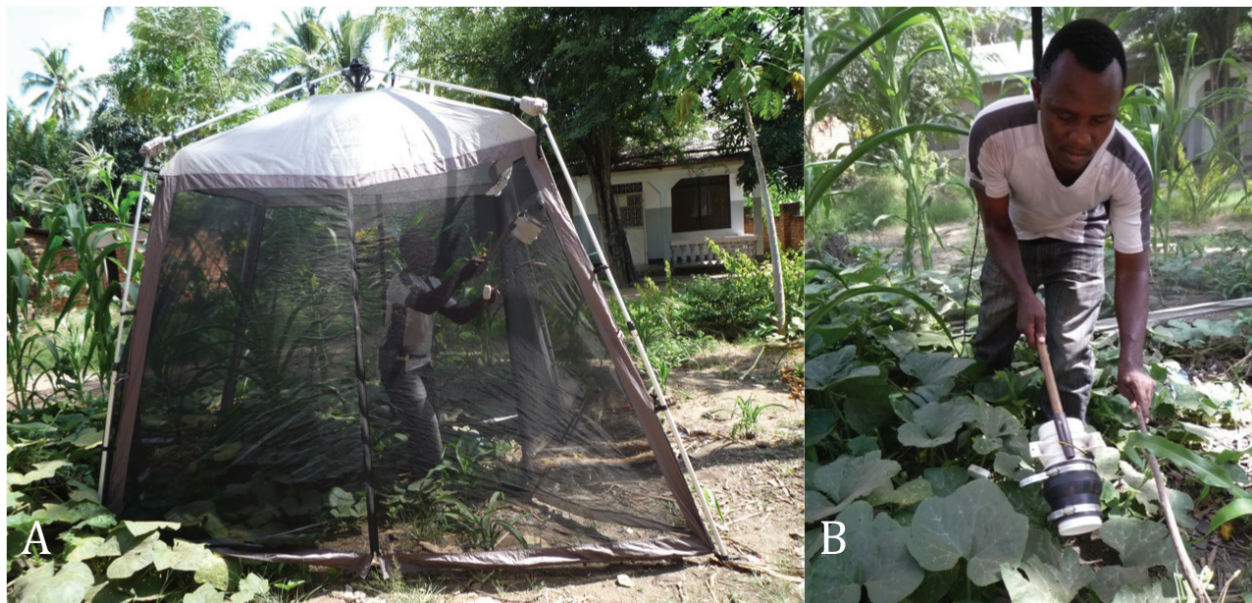
Figure 3 Drop-net. A - Field technician aspirating mosquitoes that landed on the walls of the drop-net with a Prokopack aspirator. B - Field technician beating slightly the vegetation to disturb the resting mosquitoes and aspirating them using a Prokopack aspirator.

The interaction between collector and aspirator were analysed to determine which aspirator type is capable of delivering most consistent results, despite individual variability in collection ability. Data was fitted to a generalized linear model. In this analysis an interaction