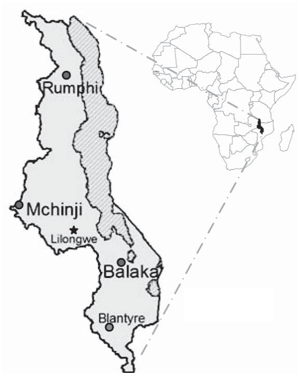
Figure 1. Location of the Research Sites in Malawi

marriage is most often uxorilocal. Descent is less rigidly matrilineal, and residence may be either uxorilocal or virilocal among the Chewa in Mchinji in the center of the country. The southern district is predominantly Muslim; Christians are in the majority in the other two areas. Marriage in Malawi is quasi-universal, but divorce rates are high, with some variation between the three research sites: in the south, over 50% of first marriages dissolve within 15 years; in the two other districts, this figure is between 30% and 40%. 7 Part of this discrepancy is related to the matrilineal system of filiation that predominates in the southern ethnic groups wherein marriage dissolution is traditionally higher (Reniers 2003). Marriage payments are more common in the northern ethnic groups but not very substantial in any of the three districts. Though parents and kin are often involved in the marriage process, their involvement rarely affects its outcome (Phiri 1983; Schatz 2002; Zulu 1996). As is the case in other parts of Africa (Locoh and Thiriart 1995; Ogbu 1978), divorce can be initiated by women as well as men (Watkins 2004).