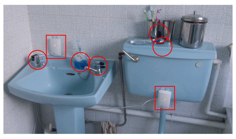
Fig 2. Elpas aystem in action. doi:10.1371/journal.pone.0171610.g002

Sensors from the three different sensitivity levels were selected to reflect the different expected motion patterns of the different objects. In order to avoid false positives, each object was affixed with the least sensitive sensor which reliably detects actual object usage. For example, toothbrush cup use would only effect a slight movement, toilet flush a slightly greater movement, and toothpaste an even greater movement. By attaching sensors to these objects, the following behaviours were measured: going to the toilet, washing hands with soap, brushing teeth, flossing, and vitamin taking. As the optimal settings for the system were still being determined for the first two households to be set up, adjustments were made to the sensors