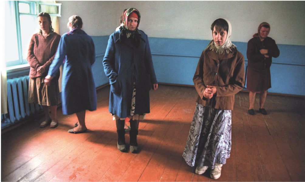
2. . Women in Priluki psychiatric hospital, Ukraine.