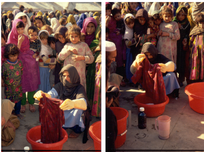
Figure 1. Dipping chadors in permethrin.

These ideas are no longer new. Insecticide treated blankets and tarpaulins were conceived of 15–20 years ago. However, the route to market for novel insecticidal products for public health is not straightforward. Such products first require