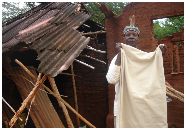
Figure 3. Factory produced, permethrin treated blankets.