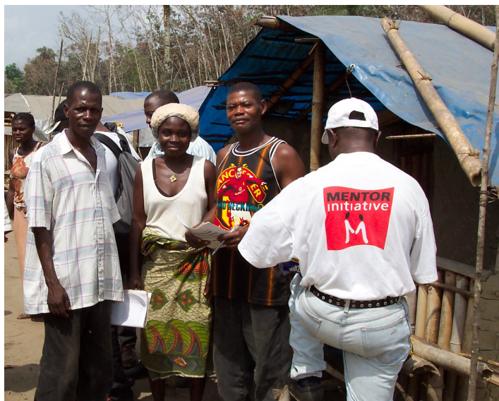
Figure 5. Sierra Leone refugees and structures made from insecticide treated plastic tarpaulins.

proof of effectiveness and recommendation from the World Health Organisation (WHO) before national malaria control programmes would consider using them. By contrast, the route to market for more standard methods, like long-lasting insecticidal nets or indoor residual insecticide spray products (IRS), is more established. Guidelines on how LLIN and IRS products