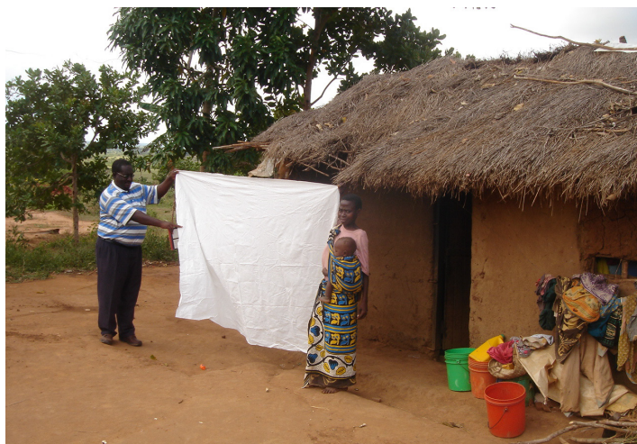
Figure 2. Factory produced, permethrin treated blankets.