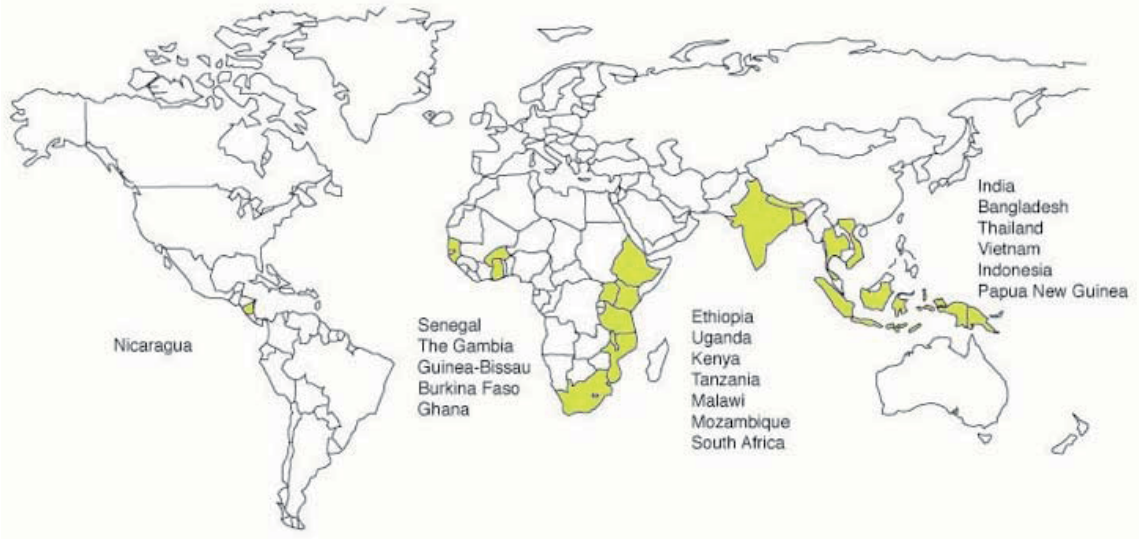
Countries with Demographic Surveillance System (DSS) Field Sites participating in the INDEPTH Network

The formation of INDEPTH was predicated on the idea that HDSS have an important role in providing high-quality, longitudinal health and demographic data, particularly in contexts where national vital statistics are either lacking or seriously compromised in quality, and on the potential for harnessing the collective capacity of multiple HDSS sites through a network. INDEPTH recognizes that networking provides a mechanism for enhancing the output of individual sites through exchange of experiences and expertise and that of the sites collectively through multi-site research collaborations. Furthermore, as part of a network, member sites should gain more visibility and influence on the global health scene than they would have independently.