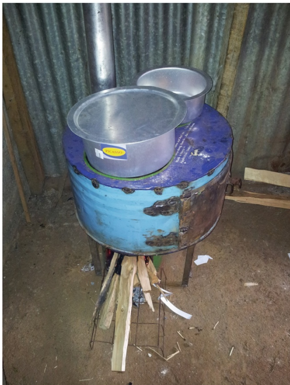
Figure 5 Locally constructed, improved cookstove installed in Kenya.

Kenya), Institute of Medicine at Tribhuvan University (Kathmandu, Nepal) and Lifespan/The Miriam Hospital (Providence, USA).