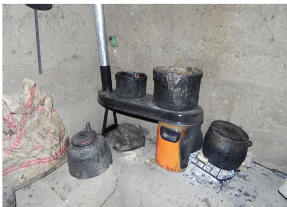
Figure 2 Envirofit G-3300/3355 installed in Peru.

The trial will be implemented at the United States National Heart, Lung and Blood Institutes and UnitedHealth Group Centers of Excellence in Chronic Diseases in Kenya (AS-ANTE Center of Excellence) and Peru (CRONICAS Center of Excellence) and at the Nepal Nutrition Intervention Project, Sarlahi (NNIPS) in Nepal. Partners include Johns Hopkins University in Baltimore, USA and Brown University in Providence, USA. All three field sites have local offices and staff that provide sufficient and culturally sensitive infrastructure for recruitment, intervention, data collection and data entry for the implementation of this project. This study was approved by the Institutional Review Boards of Universidad Peruana Cayetano Heredia (Lima, Peru), Johns Hopkins Bloomberg School of Public Health (Baltimore, USA), A.B. PRISMA (Lima, Peru), Moi University (Eldoret,