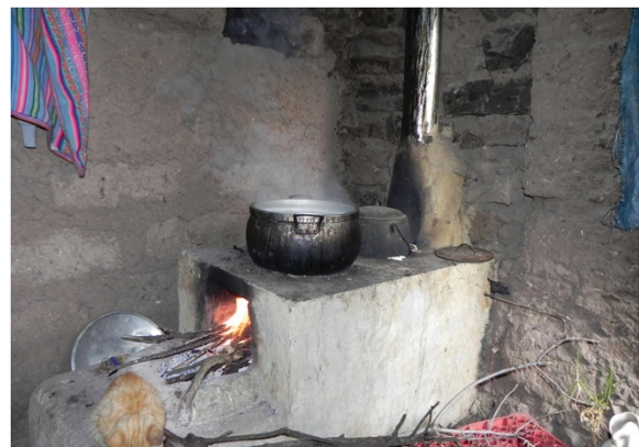
Figure 3 Locally constructed, improved cookstove installed in Peru.