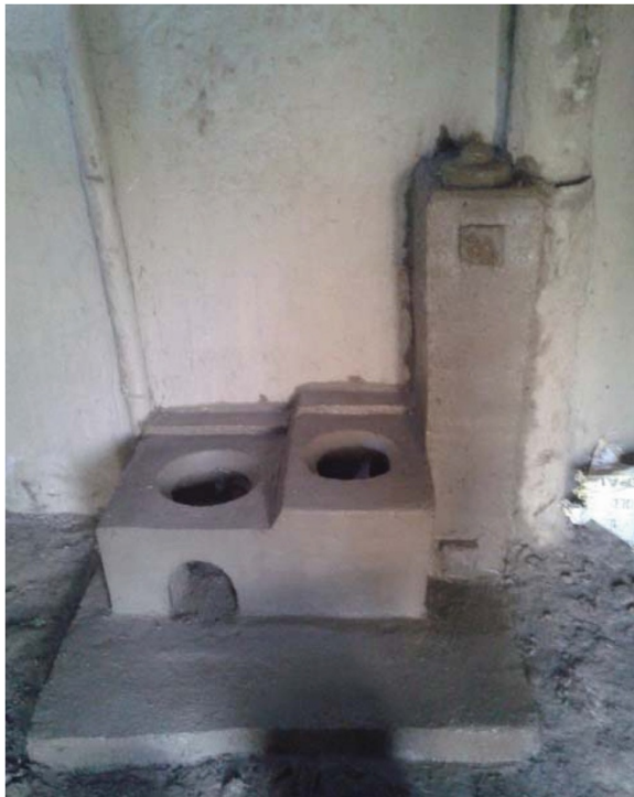
Figure 4 Locally constructed, improved cookstove installed in Nepal.