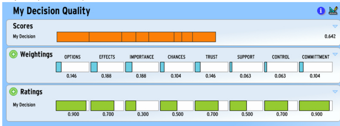
Figure 2. Example of MyDecisionQuality screen.