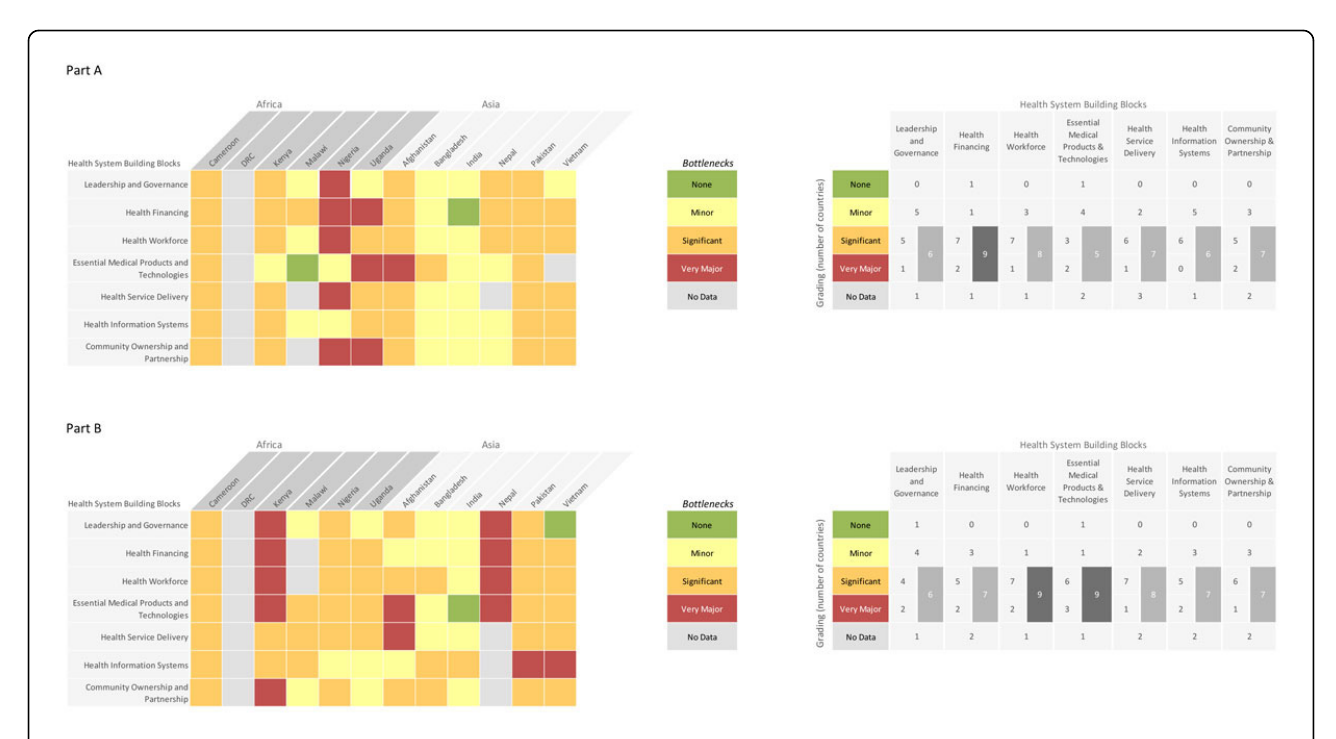
Figure 4 Individual country grading of health system bottlenecks for basic newborn care and neonatal resuscitation . DRC: Democratic Republic of the Congo. Part A: Heat map showing individual country grading of health system bottlenecks for basic newborn care and table showing total number of countries grading significant or major bottleneck for calculating priority building blocks. Part B: Heat map showing individual country grading of health system bottlenecks for neonatal resuscitation and table showing total number of countries grading significant or major bottleneck for calculating priority building blocks.

teams identified challenges within their workforce in the qualitative data. Specifically, skills, overall numbers, quality of training (pre-service and in-service), and supportive supervision were described as inadequate and available workforce were distributed inequitably (Table 1; Table S1 and S2, additional file 2). These bottlenecks were more critical for neonatal resuscitation services at district level. Lack of job aids and job description were barriers reported by participants in Asia (4 of 6 countries).