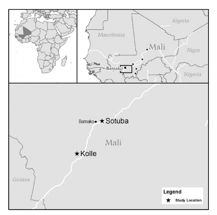
FIGURE 1. Map of Africa, Mali with capital Bamako, and study sites Sotuba and Kollé.

Sotuba and 176 mm in Kollé, during the subsequent dry season hardly any rain fell with on average 5 mm and 3 mm, respectively.