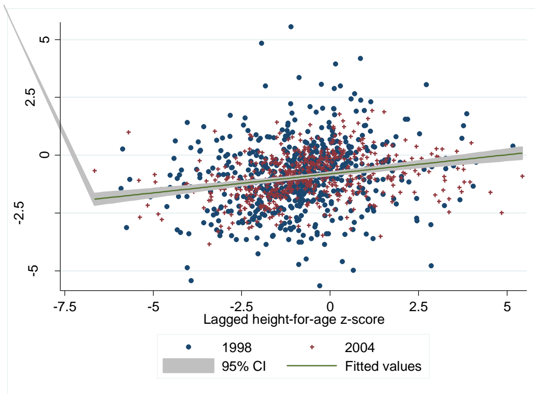
Figure 3 Relationship between children’s height-for-age z -score and their height-for-age z -score in the previous wave of the study, KwaZulu-Natal Income Dynamics Study.