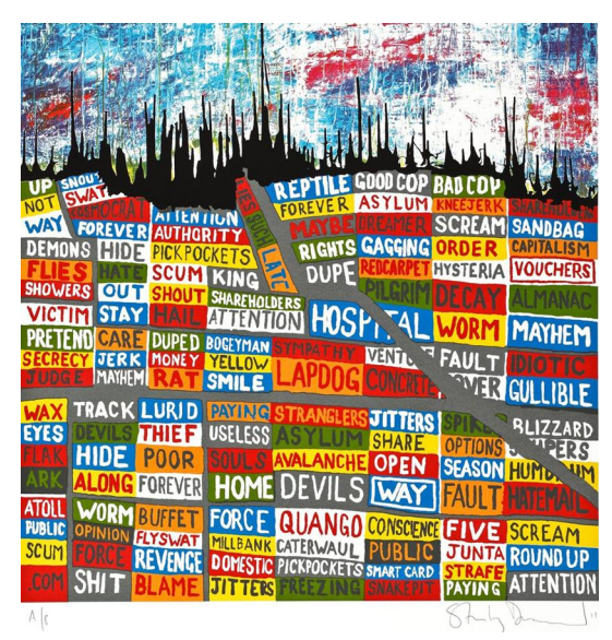
LA, 2011 by Stanley Donwood/TAG Fine Arts