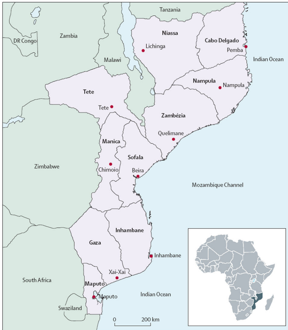
Figure 1. Political map of provinces and provincial capital cities of Mozambique