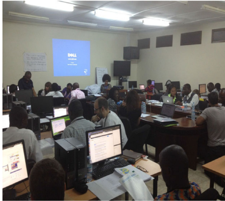
Figure 4. Bioinformatics training being conducted at the main site in Entebbe, 2013.