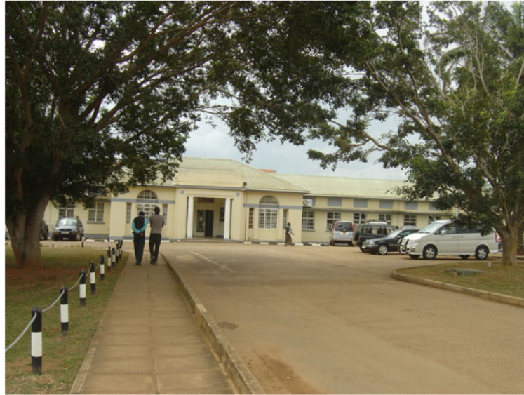
Figure 3. Uganda Virus Research Institute.