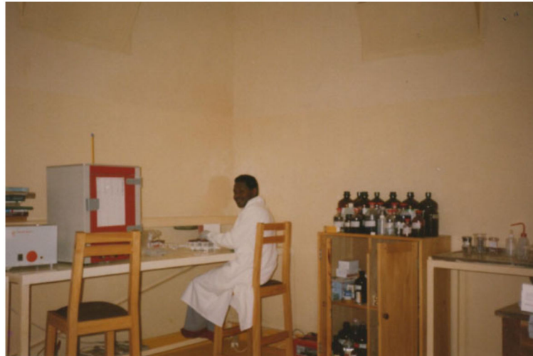
Figure 1. The laboratory at Kyamulibwa field station in 1990.