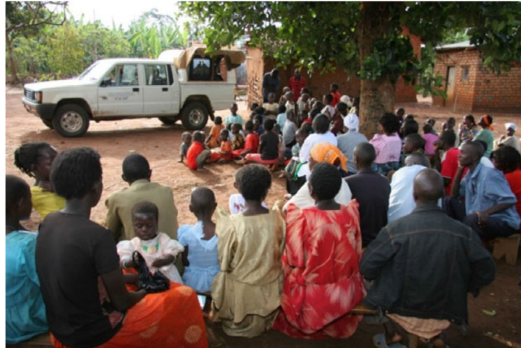
Figure 2. Community meeting in Kyamulibwa, Masaka District, 2009.