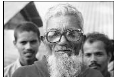
Communities should be empowered with basic health knowledge

Health issues are social needs which cannot be fully met through exclusively medical approaches. Mobilisation and better use of existing resources (human, social and financial) can lead to a significant improvement in health. The aim should be to empower communities with basic health knowledge (preventive and basic curative), so that they can make better decisions with regard to their environment and their health. Empowering communities may be done by working directly with all sections of the community or through the existing groups/institutions or through selected volunteers. In Bangladesh, Save the Children (UK) worked with and through men, women and children of the project area (see below). The International Centre for Diarrhoeal Disease Research, Bangladesh (ICDDR,B), through its Chakoria project, worked through existing self-help groups (mosque committee, school committee,