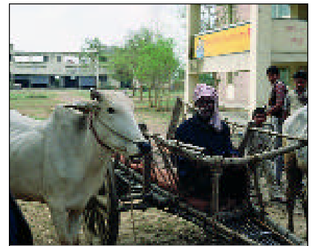
Lack of transport may be a factor in poor use of eye care services. A bullock cart brings this patient to a primary eye care clinic in India

Motivating potential treatment beneficiaries via health education, and social marketing strategies, such as the 'aphakic motivator', have been favoured strategies to improve cataract uptake. It would be a mistake to overlook the importance of social