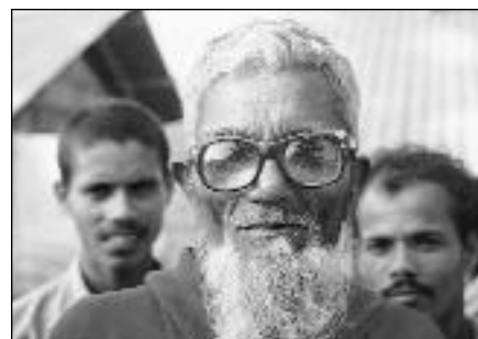
Communities should be empowered with basic health knowledge

Health issues are social needs which cannot be fully met through exclusively medical approaches. Mobilisation and better use of existing resources (human, social and financial) can lead to a significant improvement in health. The aim should be to empower communities with basic health knowledge (preventive and basic curative), so that they can make better decisions with regard to their environment and their health. Empowering communities may be done by working directly with all sections of the community or through the existing groups/institutions or through selected volunteers. In Bangladesh, Save the Children (UK) worked with and through men, women and children of the project area (see below). The International Centre for Diarrhoeal Disease Research, Bangladesh (ICDDR,B), through its Chakoria project, worked through existing self-help groups (mosque committee, school committee,