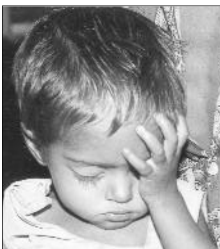
The distress of painful eyes: a child in Bangladesh

Every community has evolved ways of preventing and managing disease through its own understanding of the causes of illness. Health care is provided at many levels by many different groups of people. These include mothers and family members, traditional practitioners and private and public health workers. The contact between people and health workers through an equitable health system can lead to better understanding of the choices available to the people in addressing their health needs. It also offers an opportunity to improve people's health. At every level the capacity of people can be enhanced and the range of choices they have to protect their health problems can be increased.