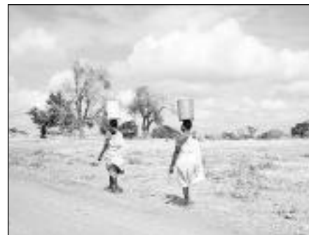
Collection of water – at a distance – in Southern Africa

This 'water use plateau' has been documented by studies in East, West and Southern Africa, Asia and Central America. It means, that for people who are already on the plateau, a water supply providing an in-house level of service will increase their water consumption, affect their hygiene and by implication reduce their level of trachoma. If house connections of water are not feasible or affordable, priority in allocating water supplies should go to those who are farthest from