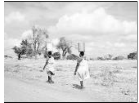
Collection of water – at a distance – in Southern Africa

This 'water use plateau' has been documented by studies in East, West and Southern Africa, Asia and Central America. It means, that for people who are already on the plateau, a water supply providing an in-house level of service will increase their water consumption, affect their hygiene and by implication reduce their level of trachoma. If house connections of water are not feasible or affordable, priority in allocating water supplies should go to those who are farthest from