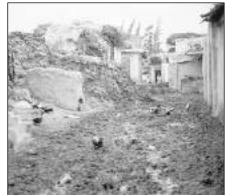
Environmental improvements are vital for the control of trachoma