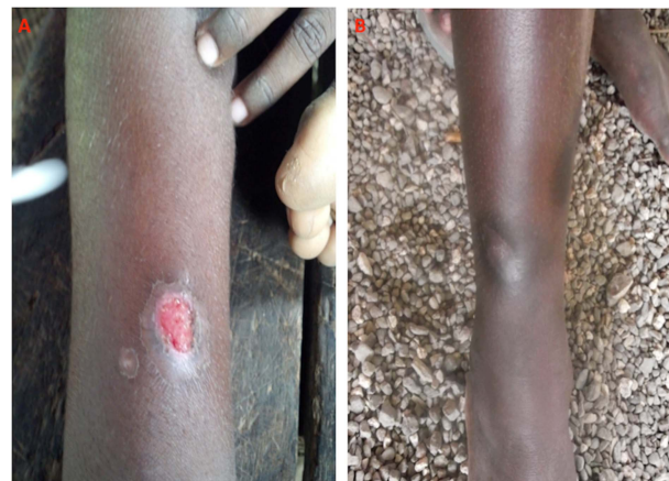
Figure 1. Clinical lesions of yaws. a) Primary yaws ulcer. b) Healed yaws lesion.

Written, informed consent was obtained from the head of each household, who was the parent or guardian of children enrolled in