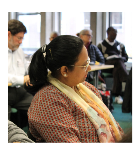
Photo above: Bill & Melinda Gates Foundation project staff sharing findings and learning at the IDEAS learning workshop