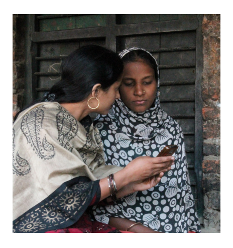
Photo left: The Manthan project's mSakhi app was shown to be used by 55% of ASHAs in the experimental arm, compared to 22% using a flip chart in the comparison arm.