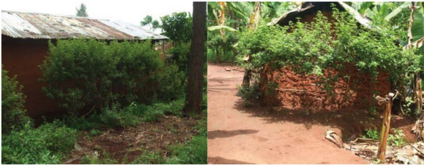
Figure 2. Lantana planted around a house in the study village. The plants grew rapidly to cover the sides of the houses where mosquitoes enter through small openings and eaves. doi:10.1371/journal.pone.0025927.g002

the abundance of suitable breeding sites. In univariable analysis there was a protective effect of having Lantana planted around homes for An. gambiae s.s., An. funestus s.s. and total mosquitoes (Table 2). There was no significant effect on indoor densities of culicine mosquitoes in houses with Lantana (IRR 0.95, 95% C.I. 0.67–1.37 p = 0.81 ).