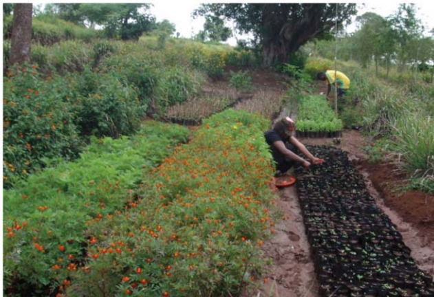
Figure 1. Concern Plant Nursery in Ngara. doi:10.1371/journal.pone.0025927.g001

Several plants were used locally to repel mosquitoes (Table S1): wild sage, Lantana ( L. camara L.); Mwarobaini, neem ( Azadirachta indica A. Juss); mchaichai, Lemongrass ( Cymbopogon citratus L.); nabhengele – several members of the genus Ocimum were used including Ocimum americanum L., Ocimum kilimandscharicum Guerke and Ocimum suave Willd. These plants had been established in a nursery by Concern Worldwide Tanzania (Figure 1). Of the plants Lantana was selected for the pilot study based upon its size and vigour (Figure 2), year round growth and known repellency towards the African malaria vector Anopheles gambiae s.s.