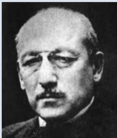
G. G. de Clérambault, 1880