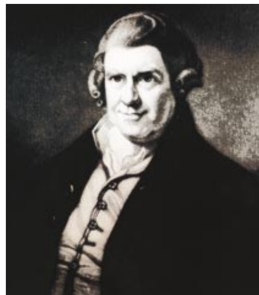
Fig 3 William Acton, 1813-1875

A marked distinction has existed with respect to the perceived responsibility of men and women for sexual