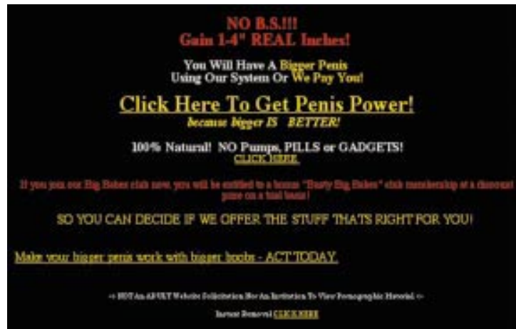
Fig 5 Furthering the “tyranny of genital sexuality”?

The authors of one American report on sexual dysfunction stated that “the strong association between sexual dysfunction and improved quality of life suggests that this problem [sexual dysfunction] warrants recognition as a serious public health concern.” 29 Yet American studies also show that many people's experiences of sexual dysfunction are associated with unsatisfying personal experiences and