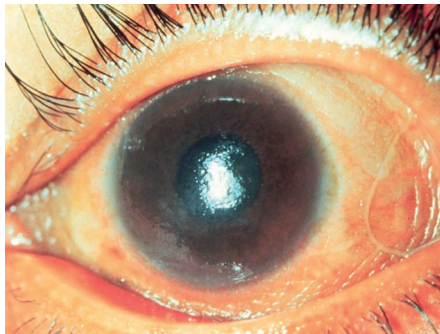
Figure 3. Corneal xerosis

This is drying of the cornea (Figure 3) and is a sign of sudden, acute deficiency. The cornea becomes dry because glands in the conjunctiva no longer function normally. This leads to loss of tears and also loss of mucous, which acts as a 'wetting agent'. The lack of mucous together with lack of tears not only leads to the dry appearance but also increases the risk of infection.