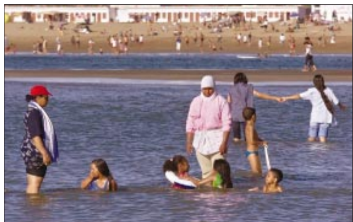
Moroccan women benefit from reproductive health programmes that have a large component of essential obstetric care

In the long term, sustaining affordable improvements in safe motherhood depends on improving the functioning of health systems as a whole. Gains made in countries such as Malaysia and Sri Lanka were achieved by making maternity care a priority that guided changes in health services. Efforts to achieve similar gains in other developing countries need pragmatic support. Sector-wide approaches and other