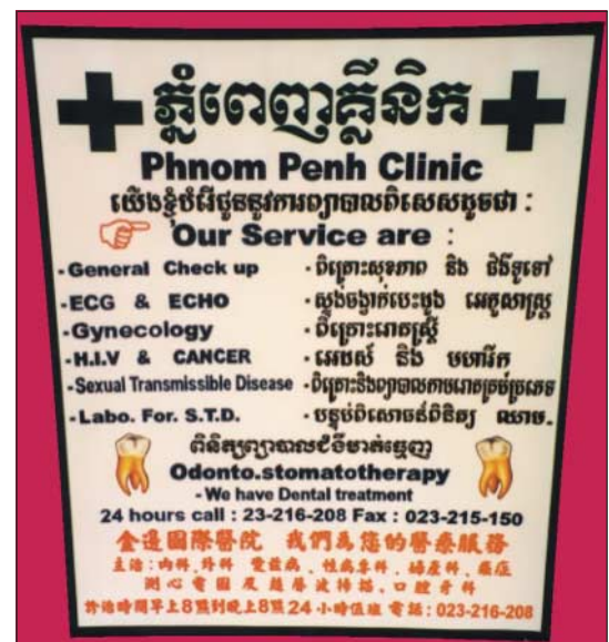
Sign from private clinic in Phnom Penh, Cambodia

Policy makers cannot afford to await conclusive evidence that private providers will soon be at the forefront of providing antiretroviral drugs in developing countries and that their treatment practices will accelerate HIV resistance to these drugs. Private