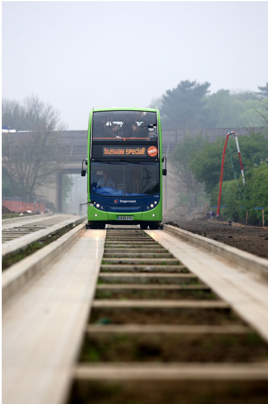
Figure 3 Bus on guided busway.

assumptions implicit in defining the boundaries of the 'intervention' and 'control' areas will subsequently be tested in two ways. First, the network distance from home to the nearest guided busway stop or access point will be entered as a covariate in analysis of the determinants of changes in travel behaviour in the cohort. Second, the results of two alternative approaches to analysis will be