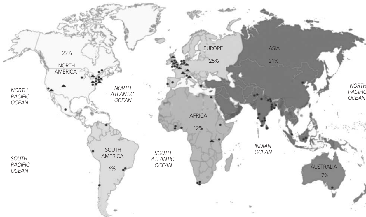
Fig. 2 Location of institutional members (n=77) and regional distribution of individual members (%) (n = 1304). Global organisations are shown as triangles and are located at either the corresponding address of the organisation or its current president. Circles represent institutional partners.

The Movement does not seek to duplicate or compete with the actions of its members; it seeks to build a coalition whose diverse members share a common goal and who can use the Movement to support their own activities and strengthen the Movement simultaneously. In all countries, people affected by mental disorders experience discrimination at multiple levels in society, 6 including within the healthcare system. Once affected by mental disorder, overcoming the layers of social barriers and discrimination is often a far greater challenge than overcoming the illness at the personal level. 6 In spite of international instruments aimed at protecting the rights of people with mental disorders, this community remains among the most vulnerable and neglected groups in all societies. 7 Against this backdrop, the struggle for social justice requires multiple actions, including an increase in availability of and access to a range of mental health services.