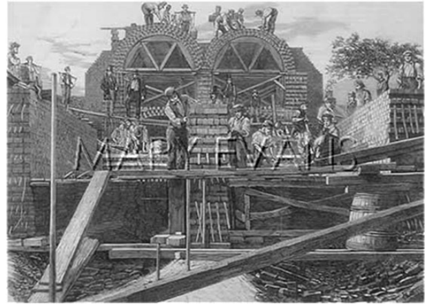
Fig. 1 London Sewer Construction in Bow, 1859. The public health service in its Victorian phase is associated with major capital projects, authorized and resourced by elected councils. In Thomas McKeown's famous account of the modern rise of population, he calculated that 33% of the mortality decline between 1848/54 and 1901 was attributable to water-borne diseases amenable to such interventions. 8

Social reform came in steps. 7 Legislation introduced a New Poor Law (creating workhouses designed to deter dependency) and established elected municipal governments with powers of taxation. In 1848, councils were empowered to appoint an MOH and improve urban hygiene; Public Health Acts in the 1870s further strengthened local departments. In 1842, Edwin Chadwick's report convinced many of the need for sanitary investment, even though the germ theory was not yet understood (Fig. 1). From 1837, civil registration of deaths gave local policymakers data on rates of mortality by age, sex, cause and place. Pasteurian bacteriology legitimized other extensions of local public health duties, which by 1900 included drainage, sanitation, safe water supplies, street cleansing, disinfection, disease notification and isolation, food safety, smallpox vaccination and institutional care principally for 'lunatics' and infirm older people. Between 1900 and 1929, eugenics and militarism fuelled population health concerns that conferred new local responsibilities for maternal and child welfare, health visiting, school medicine, venereal diseases and learning disabilities, while the 'homes fit for heroes' agenda involved health departments in slum clearance. 8,9 In the 1930s, stigmatizing aspects of the Poor Law were diminished, with ex-workhouses used as municipal general hospitals or institutions for older people. By then, the social and health responsibilities of local government had