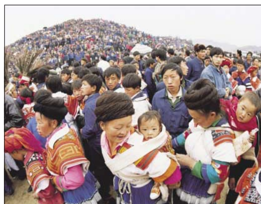
Social support after childbirth is linked with low rates of postpartum depression

We have provided some examples at different levels of the pathway to care and prevention of mental illness where the developed world could learn from the developing world. High income countries considering such developments would have to make them fit for purpose in a different social and economic environment. The issue of sustainability also arises. Community based support after childbirth has a long history, and medical ward care for psychiatric emergencies in Jamaica has been used for 30 years, but