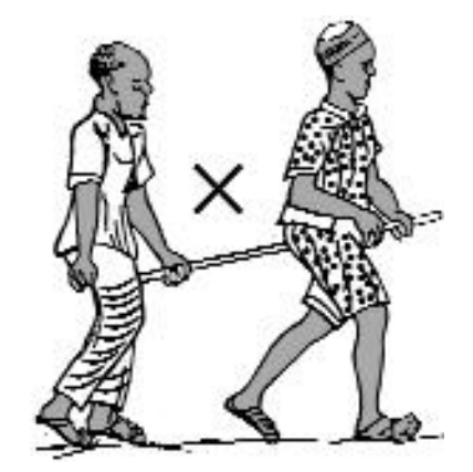
Fig. 9: 'Don't pull me!'

Eye health workers have a responsibility, and an important position, for teaching others about assistance to the visually impaired. But we must be seen to be practising what we teach. A community-based rehabilitation project in Uganda, some years ago, used a very appropriate and challenging means of raising awareness.