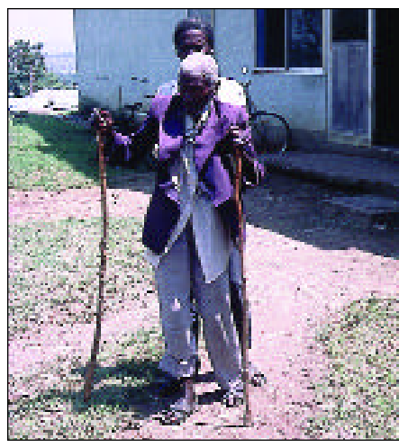
Trying to be helpful – but the patient would have felt more supported if the helper had walked alongside him