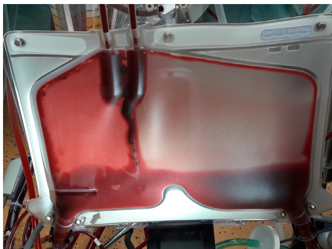
Fig. 1. Visible clots in the reservoir of the cardiopulmonary bypass circuit.

pump. After revascularization, heparin was partially antagonized with 15,000 IU of protamine, resulting in an ACT of 166 seconds. During surgery, 2 units of red blood cells were administered. In the intensive care unit, a patient was treated with additional 7,000 IU of protamine because of excessive blood loss from the wound drains, after which blood loss decreased substantially. On day 1, the patient was transferred from the intensive care unit to the ward. On day 3, FXI levels decreased to 11%. The patient was discharged from the hospital on day 4 after receiving 1,000 IU of Hemoleven, which, in turn, increased FXI level to 22%. There were no thrombotic complications reported in the postoperative period and after discharge to home.