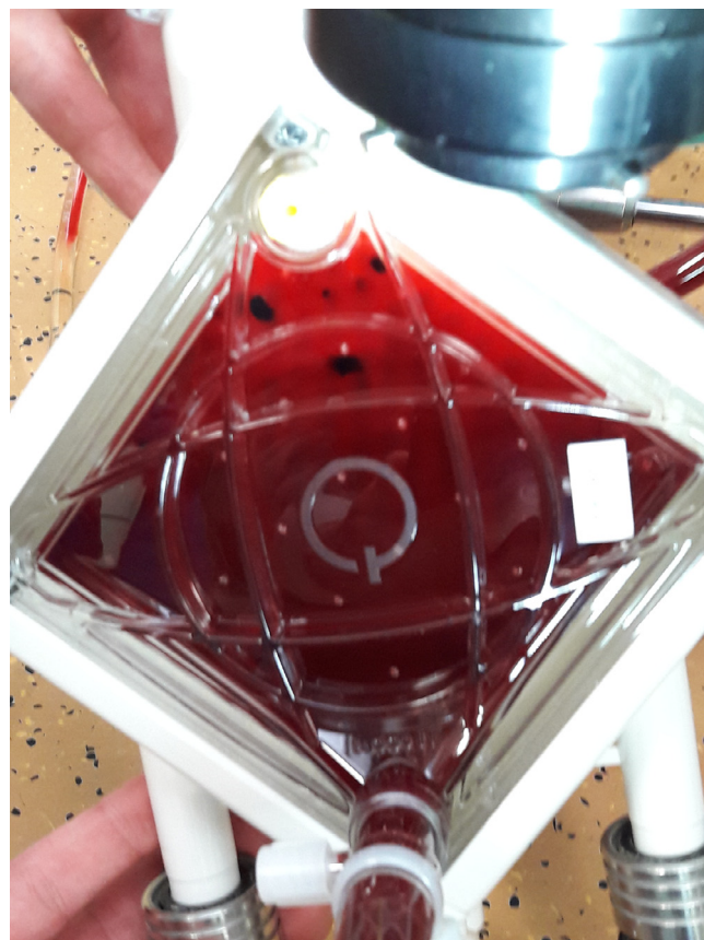
Fig. 2. Visible clots in the oxygenator of the cardiopulmonary bypass circuit.

FXI deficiency can be caused by a decreased activity of FXI owing to a decreased level of FXI or the presence of a FXI inhibitor. Recommendations for perioperative treatment include antifibrinolytic therapy and preoperative administration of fresh frozen plasma or FXI concentrate in case of decreased level of FXI. Target activity for FXI is 40% to 50% for minor surgery and 60% to 70% for major surgery. 3 If a FXI inhibitor is present, FXI supplementation is not beneficial and successful management in case of FXI inhibitor has been achieved with low dose recombinant FVIIa and antifibrinolytics. 4