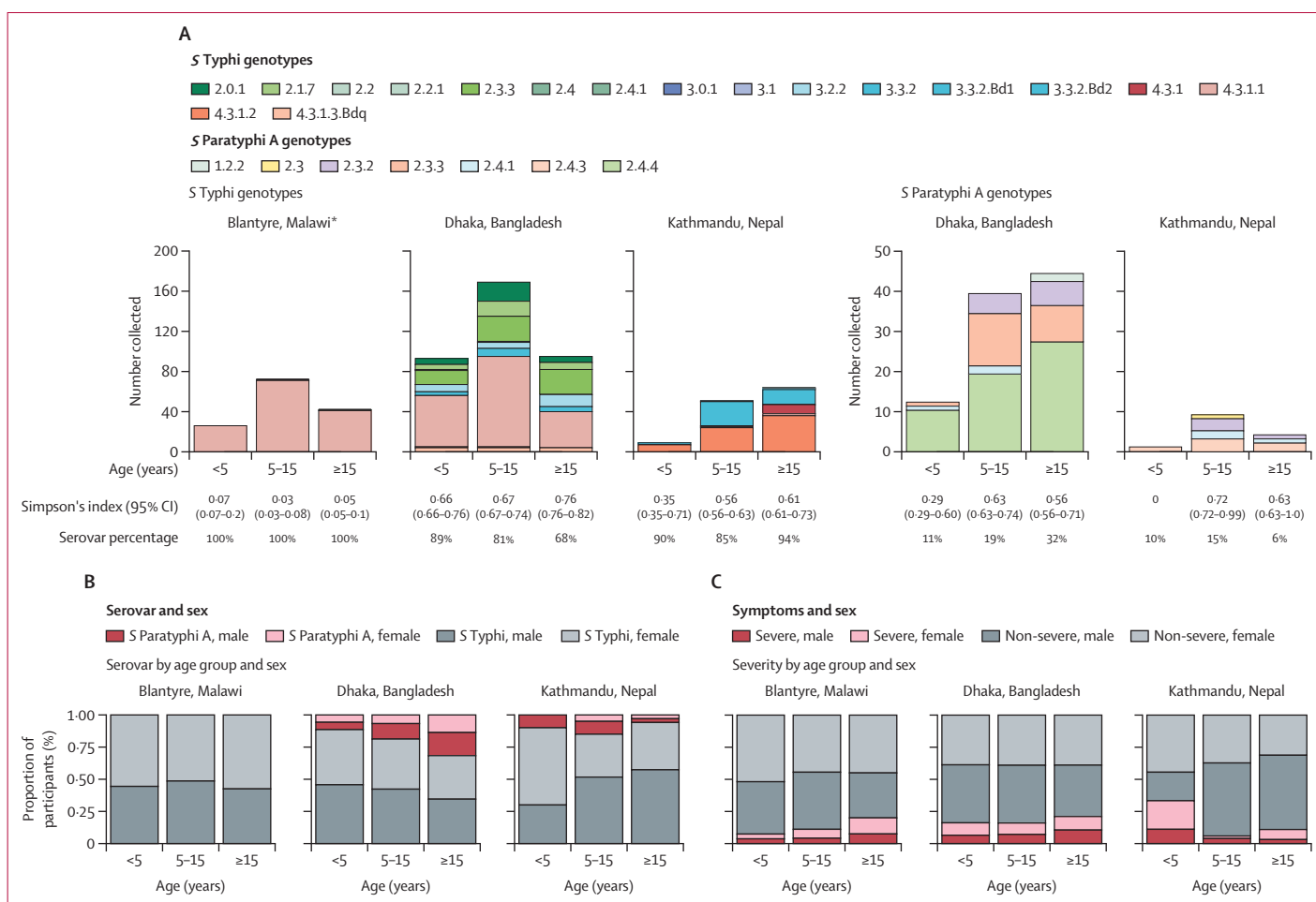
Figure 1: Distribution of pathogen variants and disease severity by age group

(A) Barplots show frequency distributions of pathogen genotypes among age groups, stratified by serovar and location, for the main STRATAA dataset (n=622 Salmonella enterica serovar Typhi and n=109 Salmonella enterica serovar Paratyphi A; table 1). Simpson's diversity index is shown under each bar (calculated from genotype counts, excluding isolates from the extended surveillance period in Blantyre to ensure comparability between locations), along with the frequencies of each serovar (S Typhi or S Paratyphi A) as a percentage of all sequenced isolates from the given location and age group. (B) Breakdown of patient sex and pathogen serovar, within each age group at each site, for the main STRATAA dataset. (C) Breakdown of patient sex and disease severity (severe was defined as a symptom duration >10 days or requirement for hospitalisation), within each age group at each site, for the main STRATAA dataset. *4.3.1.1 in Blantyre is sublineage 4.3.1.1.EA1.