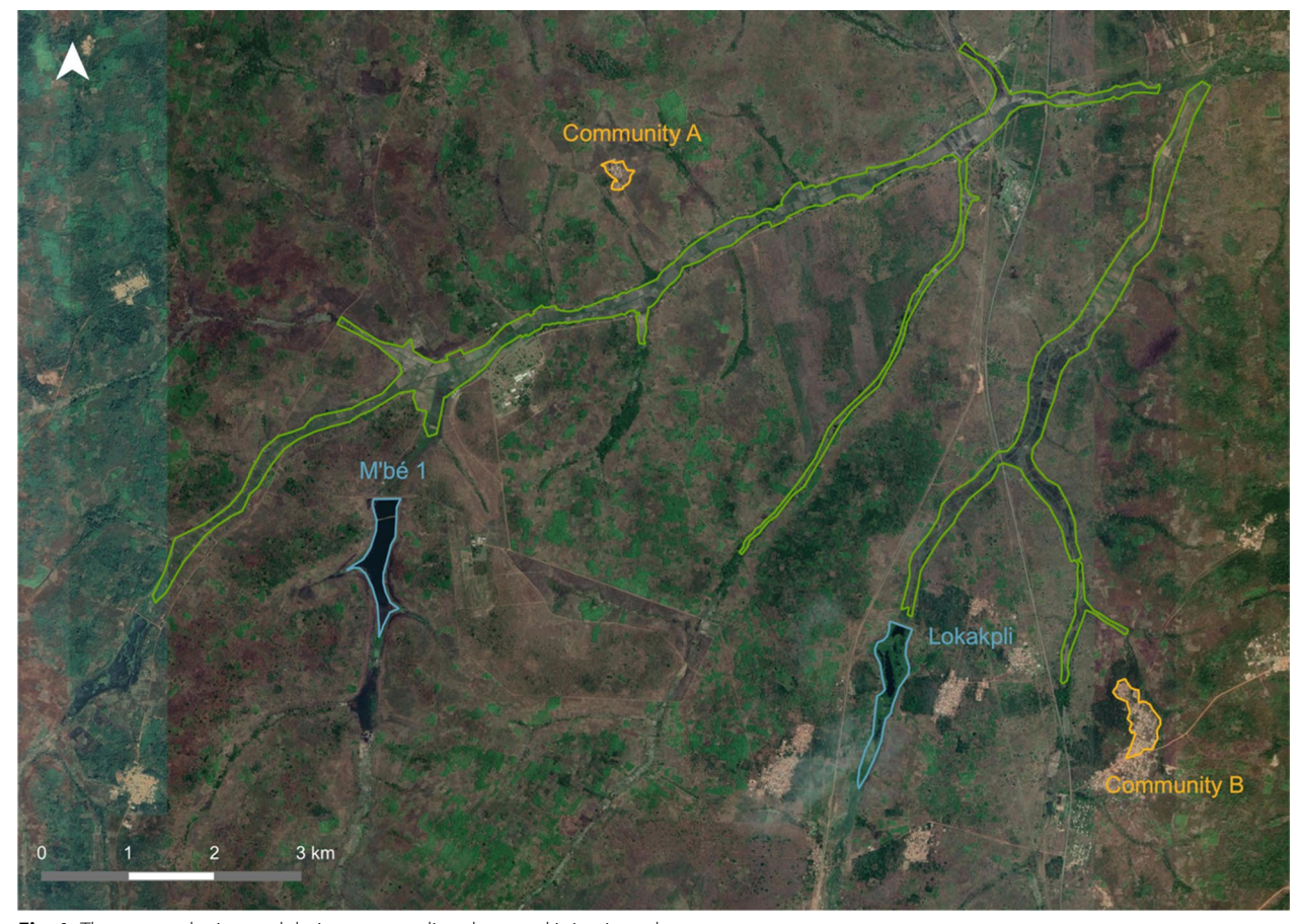
Fig. 1 The two study sites and their corresponding dams and irrigation schemes

Ethnographic immersions were conducted for 1 month at each village. Observation grids, which are guides to remind the observer the topics of interest, were used to record information on rice cultivation and mosquitoes within domestic spaces and rice farms. The following