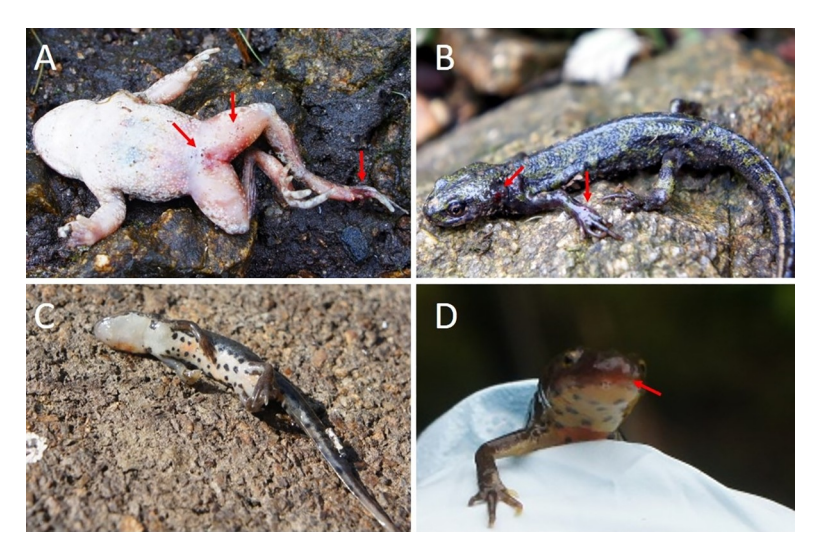
Fig 2. Signs of ranavirosis in three amphibian species. (A) Dead Alytes obstetricans with erythema (redness of the skin) around the cloaca and an open lesion on the foot. (B) Live Triturus marmoratus with open lesion on the neck and hemorrhaging along digits and the spine, and apparently loose skin. (C) Dead Lissotriton boscai without clear outer signs of ranavirosis such as lesions or hemorrhaging. (D) Live L. boscai with facial hemorrhaging, skin around the mouth appeared swollen and animal seemed to have problems opening its jaws. The species we found dead in most abundance was L. boscai. Diseased L. boscai exhibited lethargic, and disoriented behavior. We found apparently diseased L. boscai within four meters of the edge of the reservoir and seemingly heavily diseased specimens of this species. We did not observe open lesions on L. boscai which likely increased detectability of diseased specimens of this species. We did not observe open lesions on L. boscai which instead presented with subcutaneous hemorrhages and craniofacial swelling (Fig 2D). Triturus marmoratus frequently suffered from open skin lesions and lethargic, disorientated movements (Fig 2B). We found T. marmoratus eggs under terrestrial refuges close to heavily diseased animals (S1 Fig) and several individuals—both live and dead—that were emaciated (loose skin, increased prominence of the spine, Fig 2B).

Natrix maura was the only snake species observed during this study and Bocage's wall lizard ( Podarcis bocagei ) the only species of lizard sampled. Neither species displayed physical or behavioral signs of ranavirosis. A single N. maura carcass was collected exhibiting no visible external signs of ranavirosis. The gross post-mortem found the specimen to be in good physical condition and it was not possible to determine a cause of death.