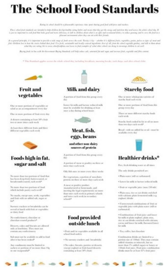
Figure 2 The School Food Standards in England

A summary of the standards and a practical guide are available at school food standards: resources for schools<sup>18</sup>. They set out a food-based approach "designed to make it easier for school cooks to create imaginative, flexible and nutritious menus". They also include recommended portion sizes.